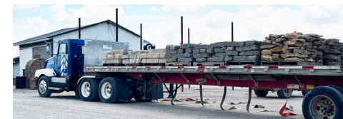
110 Tractor Trailer

Donkey Forklift Requires 8.5' W & 10' H Clearance