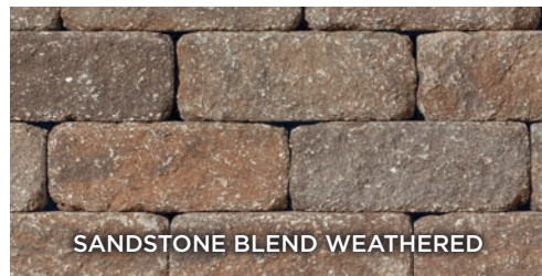
SANDSTONE BLEND WEATHERED