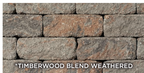
*TIMBERWOOD BLEND WEATHERED