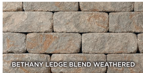
BETHANY LEDGE BLEND WEATHERED