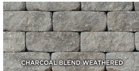
CHARCOAL BLEND WEATHERED