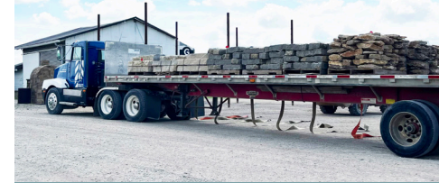
110 Tractor Trailer