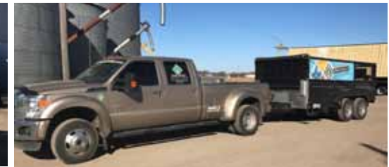
Dump Bed Delivery Equipment (Hard Surface Only) 6 ton of aggregate/soil or 15 yards of mulch