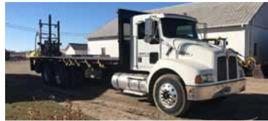
Flatbed Delivery Equipment w/Donkey Forklift (See Back for Details) Up to 15 ton of product

>30 Miles - base rate +$5 per loaded mile